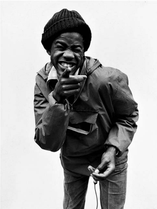
Handsworth Self Portrait, 1979