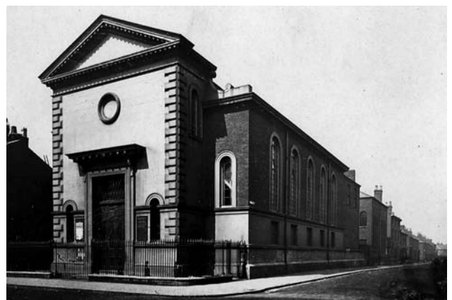
Heneage Street Chapel, late 19th century

The photo (below) of Heneage Street Chapel (no longer standing) is an important reminder of this history. This site originally contained 'The Negro Emancipation School Rooms', with a foundation stone laid in 1838 by local abolitionist Joseph Sturge to mark the end of the apprenticeship system in the West Indies. A few years later, money was raised for a complete chapel and the Heneage Street Baptist church opened on 9 June 1841"