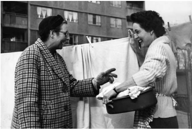
From a collection of 'Socialism' photographs

On the 18th of March about 100 people attended the One City - Many Stories event which was organised by Connecting Histories in Birmingham Library Theatre. The day was intended to share ideas and information on the experiences and practices of a variety of community groups who are involved in community history projects in the city. Interesting and inspiring presentations were given by the British Bengali Heritage Project , Canon Street Memorial Baptist Church Project , Birmingham St Patrick's Festival Oral History Project , Small Heath Community Forum Rainbow Project , and the New Style Radio Oral History Project .