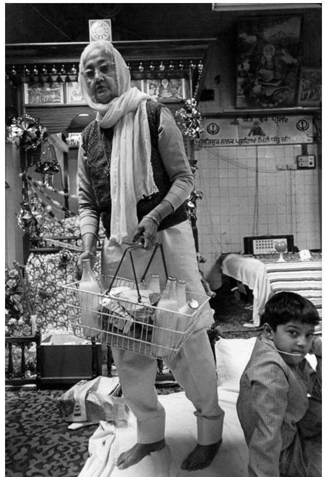
'Removing Offering from Shrine; Guru Ravidas Temple, Wolverhampton'.