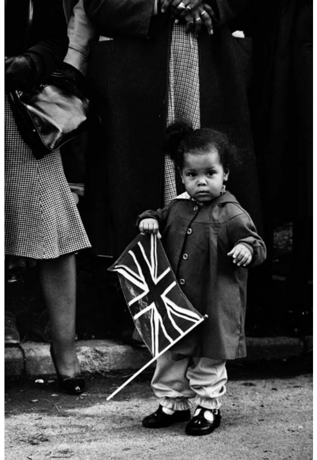
'Waving the Flag, Prince Charles Visit' by Derek Bishton, 1981

Derek Bishton and Merrise Crooks set up Handprint project in 1983, to produce publications for use in basic skills teaching for young black people. Some of these publications are included in the collection, as well as the extensive Handprint press cuttings library, which contains cuttings relating to issues affecting black people in Britain and abroad during the 1980s and early 1990s.